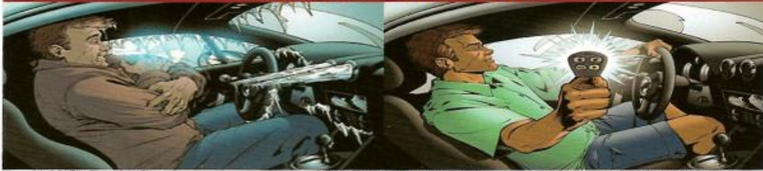
Add-On Remote Start