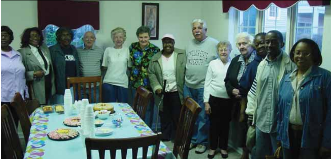
Just some of the many members of the Society Hill II Senior Club took a moment to pose in the kitchen of the clubhouse before their April 2010 meeting.

A s SHII's longest running club, the Society Hill II Seniors have been meeting at 7 p.m. in the clubhouse the first Monday each month for almost 13 years!