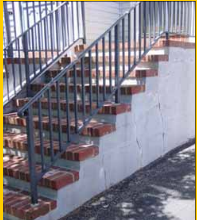
Side view of a SH2 stoop shows cracking and lack of “weep holes” to allow water drainage.

This will mean fewer repairs will be necessary for many years in the future.